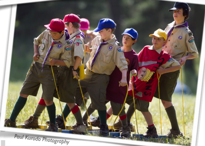
Paul Kurodo Photography