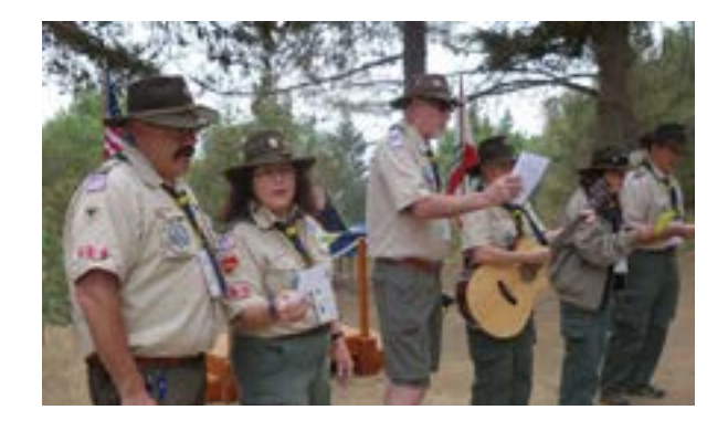
"The training has helped me broaden my horizon of different prospectives regarding scouting. I met many new people, made new friends, from other councils as well as from our own. The collection of dedicated people are the true inspiration."

✓ Have Parts A, B and C of a current BSA Medical Form completed and signed by a doctor